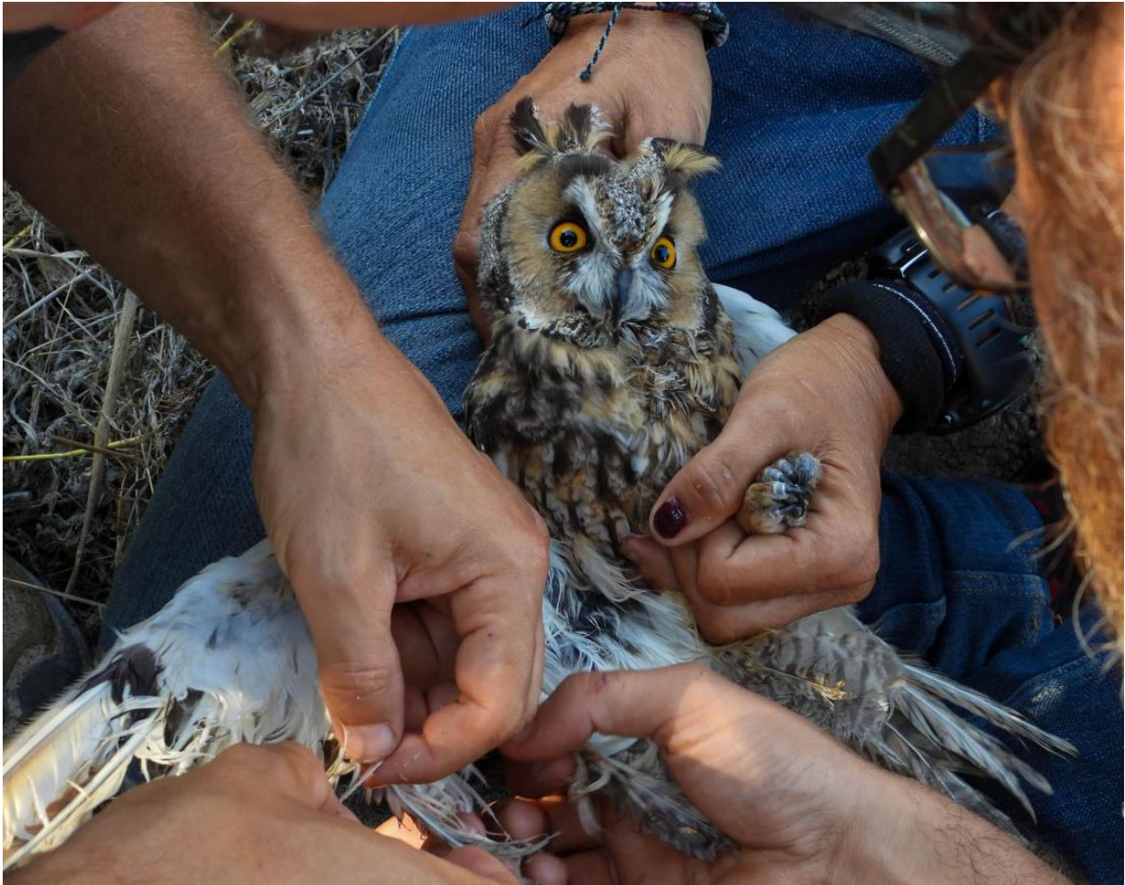
Picture 3. Long-eared owl freed from glue trap. CABS & SPA autumn BPC 2023.