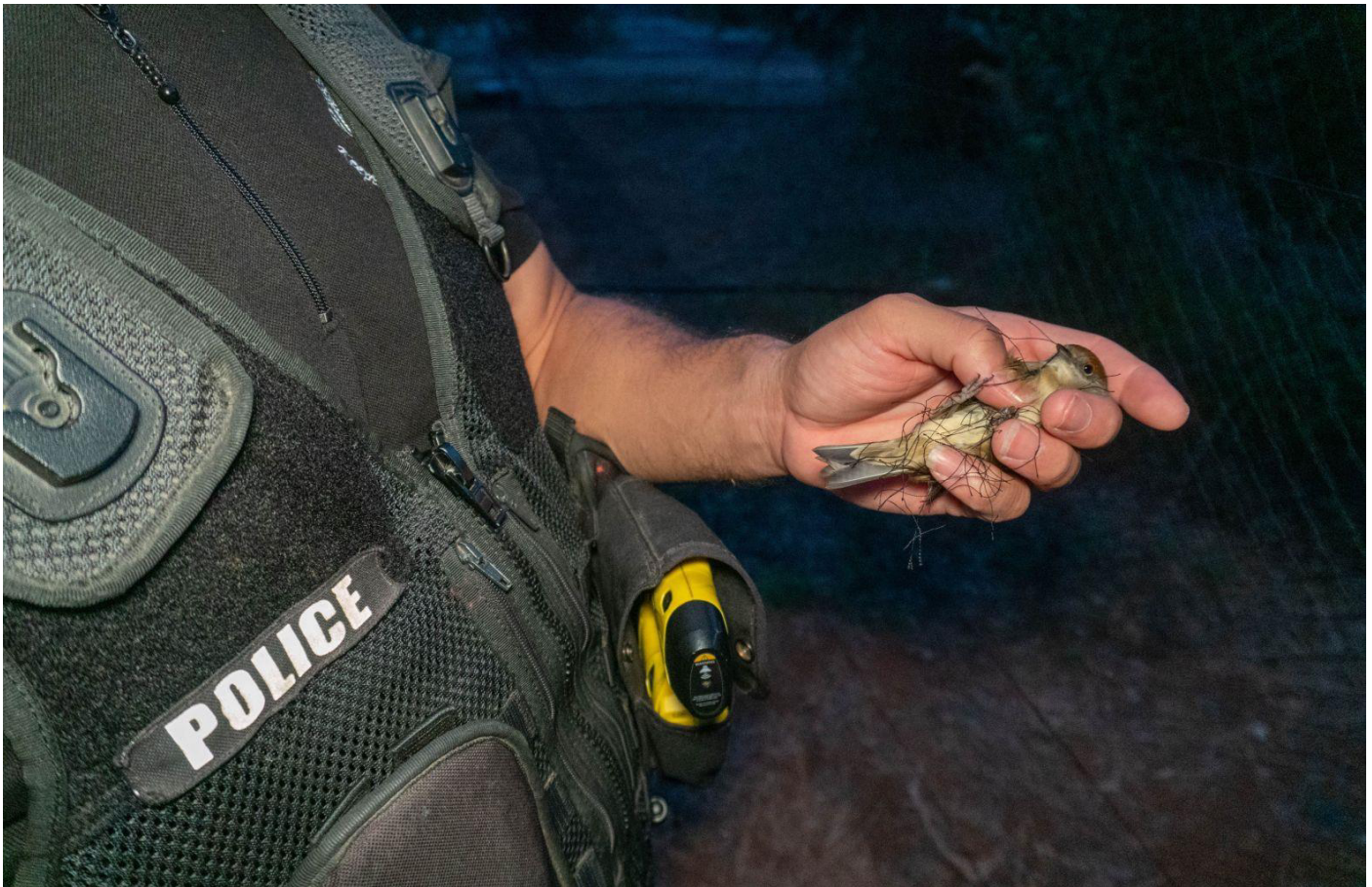
Picture 2: Blackcap released from a net by SBA police. CABS & SPA autumn BPC 2023 (Photo: CABS).