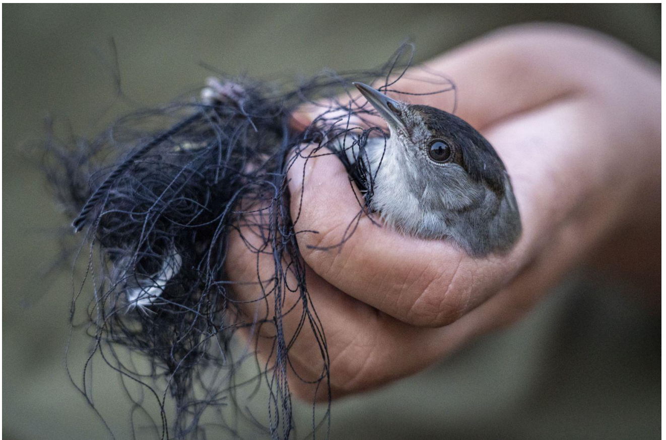
Blackcap entangled in net before release in the Republic of Cyprus.